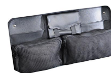
1449 Office Lid Organizer