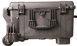
1620MNF No Foam