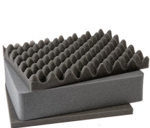
1451 3 pc. Replacement Foam Set