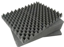
1471 3 pc. Replacement Foam Set