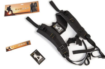
RucPac-normal RucPac Standard Hardcase Backpack Conversion

c/ Provença, 388, Planta 7 • Barcelona, Spain 08025 • Phone: +34 934 674 999 info@peli.com • www.peli.com