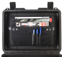
iM24XX-LIDORG Lid Organizer