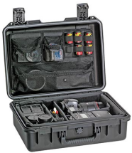
iM24XX-PHOTO PALLET Photography Pallet