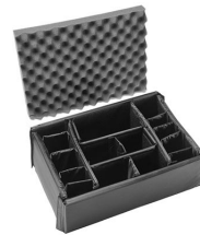
iM2450-DIV Padded Divider Set