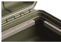
iM24XX-BEZEL Base Bezel Kit