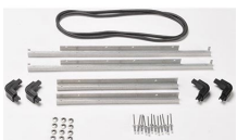
iM2600-M4-BEZEL-L Lid Bezel (Metric)