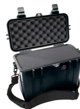
1430WF With Foam