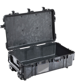
1670NF No Foam