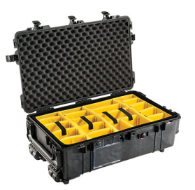
1674 With Padded Dividers