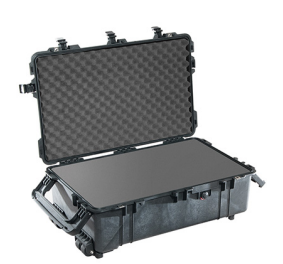
1670WF With Foam