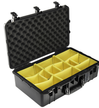
1555WD With Padded Dividers