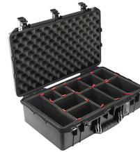
1555TP With TrekPak Divider System