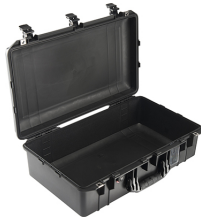
1555NF No Foam