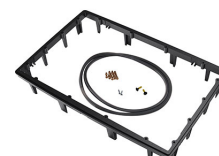
1490PF Special Application Panel Frame