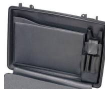
1498 Computer Lid Organizer