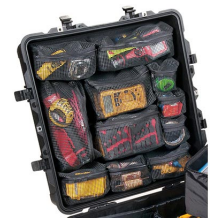
0379 Lid Organizer