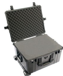
1620WF With Foam