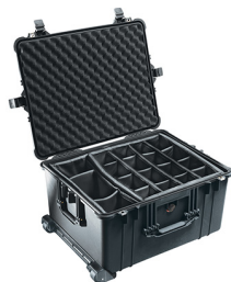
1624 With Padded Dividers