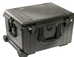
1620NF No Foam