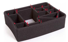
1550EUTP TrekPak Case Divider Kit