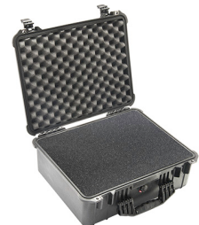
1550WF With Foam