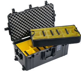
1626WD With Padded Dividers