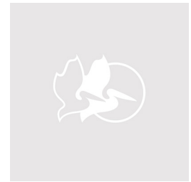
AL2624-1205RPFC With Foam, With Casters