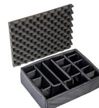
1525 Padded Divider Set