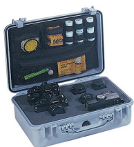
1508 Photographer's Lid Organizer

Master Pack 2 Nameplate yes Military yes