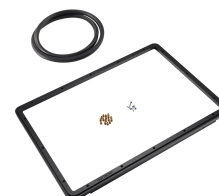
1520PF Special Application Panel Frame