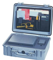
1509 Lid Organizer