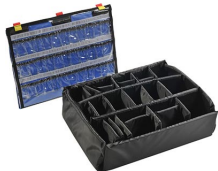
1555EMS EMS Accessory Set (Lid Organizer and Divider Set)