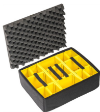
1555 Padded Divider Set