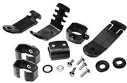
0770 Helmet Light Holder