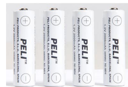
2469P Replacement Battery