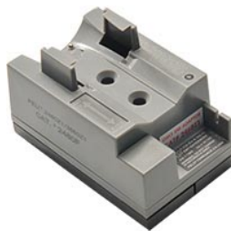
2480F Deck/Dash Charger Base Unit