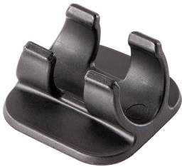
1975H Helmet Light Holder