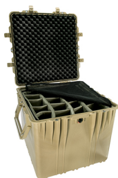
0374 With Padded Dividers