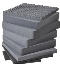
0371 8 pc. Replacement Foam Set