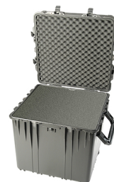
0370WF With Foam