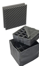
0375 Padded Divider Set