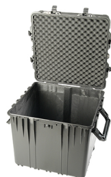
0370NF No Foam