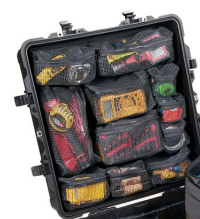
0379 Lid Organizer