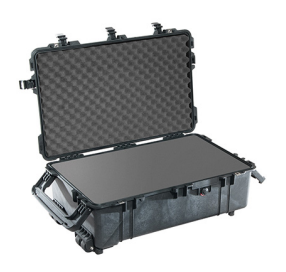
1670WF With Foam