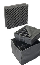
0375 Padded Divider Set