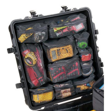
0379 Lid Organizer