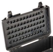
1535MP EZ-Click™ MOLLE Panel