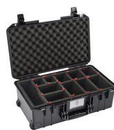
1535TP With TrekPak Divider System