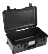
1535NF No Foam