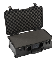
1535WF With Foam