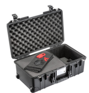
1535AIRTPF TrekPak / Foam Hybrid