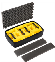
1535AirDS Padded Divider Set