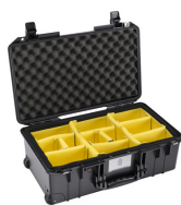
1535WD With Padded Dividers