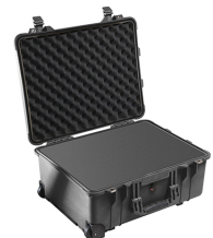
1560WF With Foam