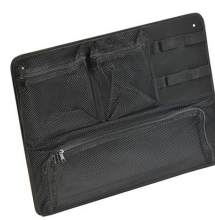
1569 Lid Organizer