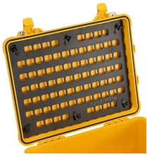
1560MP EZ-Click™ MOLLE Panel

c/ Provença, 388, Planta 7 • Barcelona, Spain 08025 • Phone: +34 934 674 999