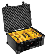
1564 With Padded Dividers