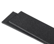
1560TPDIV Extra TrekPak Dividers