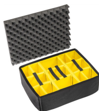
1565 Padded Divider Set