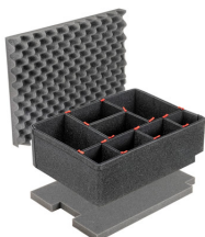
1560TPKIT TrekPak Case Divider Kit