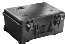
1560NF No Foam