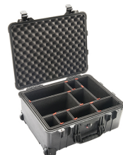
1560TP With TrekPak Divider System