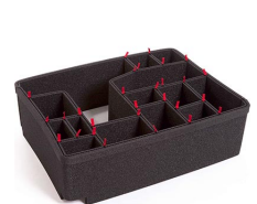
1560EUTP TrekPak Case Divider Kit