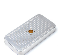
1500D Desiccant Silica Gel